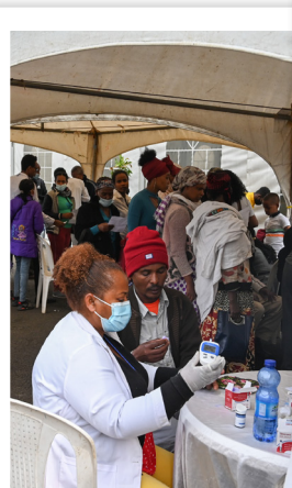
It Is Written medical missionary teams ministered to 15,000 people in Ethiopia.