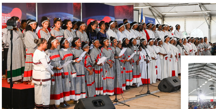
Local choirs provided beautiful music, while hundreds of people responded to appeals to surrender their lives to Jesus.

baptized in It Is Written evangelistic meetings so far this year, we are looking for God to do even greater things in the year to come.