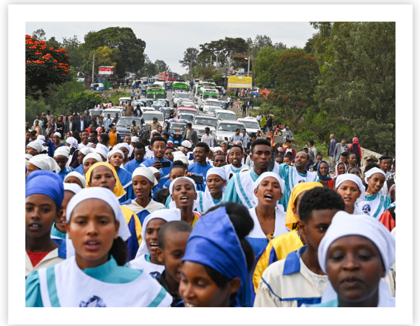
Authorities closed roads and held a parade to welcome our team of volunteers to Ethiopian cities.

Jesus is coming back soon. This is a time of ingathering, a time of both sowing and reaping. Even though this world is darkened by sin, there are great numbers of people looking in the direction of heaven.